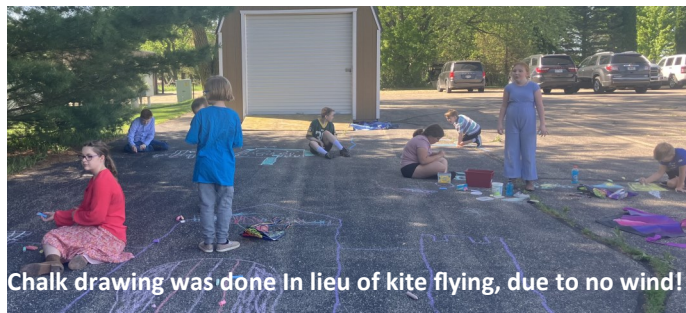
Chalk drawing was done in lieu of kite flying, due to no wind!