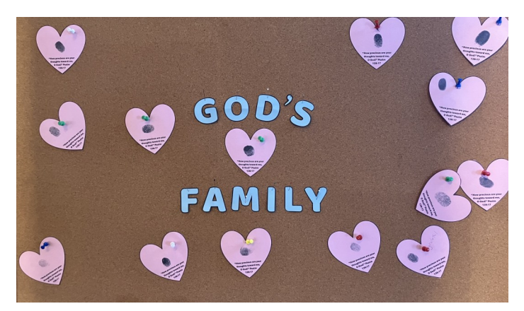
From the Ash Wednesday prayer stations of 2024.

What's that new song? Check out our church Worship Music Playlist to hear some of the new music before Sunday mornings.